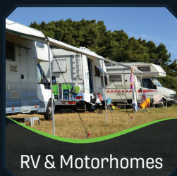
RV & Motorhomes

Customise systems up to: 1S/1-16P 12V 100Ah to 1600Ah 2S/1-8P 24V 100Ah to 800Ah 4S/1-4P 48V 100Ah to 400Ah